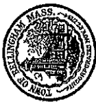
EXHIBIT D Opt-Out Reply Card