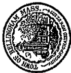
EXHIBIT C Opt-Out Envelope

PRESORTED STANDARD US POSTAGE PAID CITY, XX PERMIT, NO XXXX